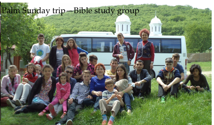
Palm Sunday trip – Bible study group