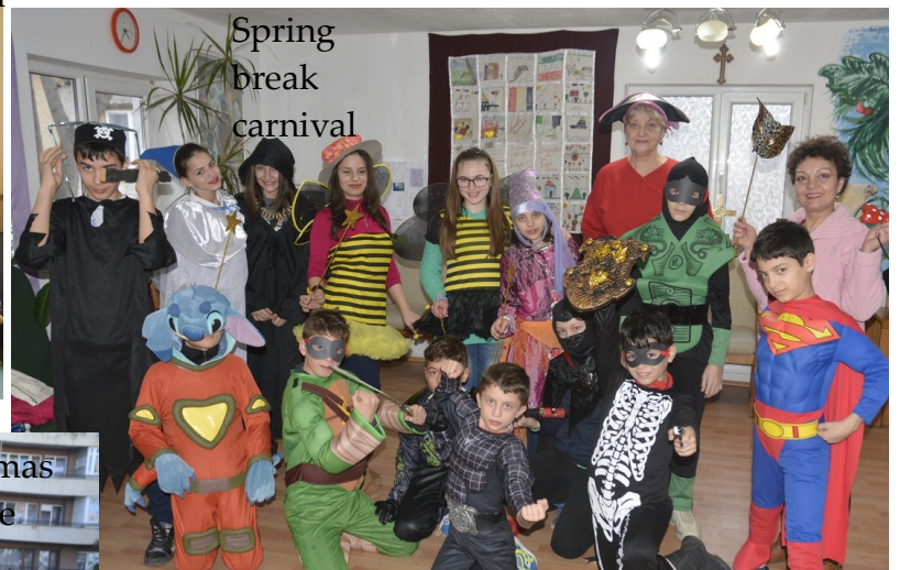
Spring break carnival