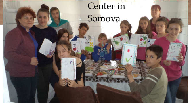
Center in Somova