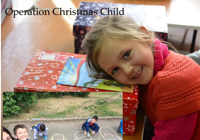
Operation Christmas Child