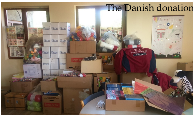
The Danish donation