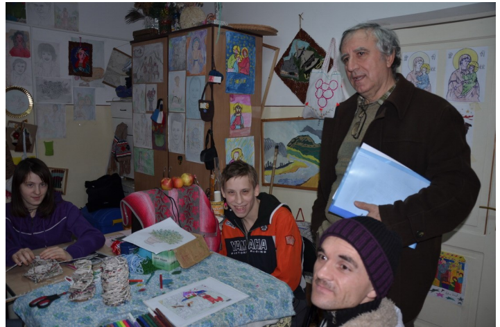
Visit to residential Centre for Adults with Disabilities in Babadag.