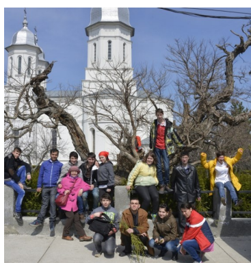
For Palm Sunday, thirteen youth and five staff visited Saon and Cocoș monasteries for worship and a shared meal. The visit nurtured spirits and bodies!