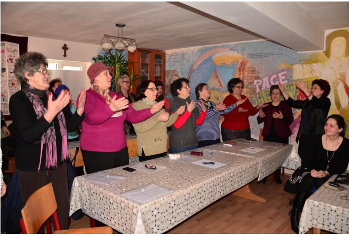
Conscious Discipline Training with the Grannies supports trauma—informed practice.