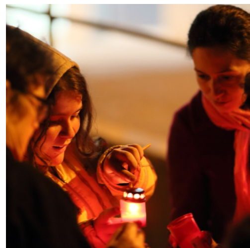
Easter Eve—youth and staff received and carried the light back to Speranța from the midnight service.