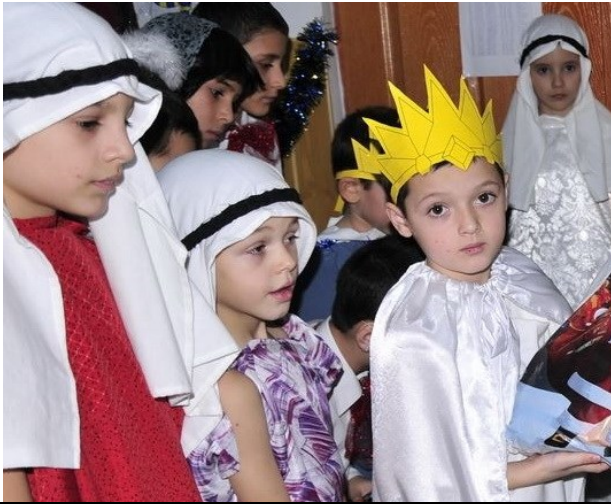
These kids are waiting to be in a small family group.

You've heard of NOROC's "Big-Hearted Grannies." Grannies relate daily to kids under seven. For older kids, "Big-Hearted Friends" forge safe and ongoing relationships in groups of eight or ten, meeting as often as they can. Our wish is to invite every institutionalized child into relationship with a family group. In small groups, kids: