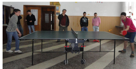
Table Tennis Competition sponsored by NOROC draws competitors and ends with winners!