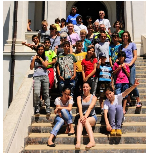
Our group along with some of the older children as we visited one of the local Orthodox monasteries.