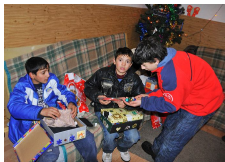
Waiting a little longer did not diminish the joy of these children as they opened their presents!